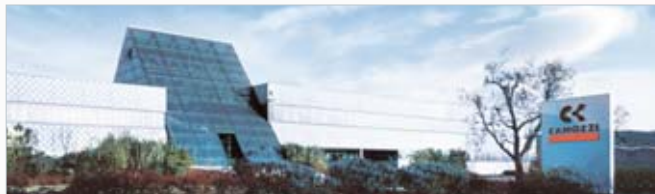
Camozzi spa Design and Development Centre, Polpenazze, Italy

Camozzi spa Società Unipersonale Via Eritrea, 20/I 25126 Brescia - Italy Tel. +39 030 37921 Fax +39 030 3792244 info@camozzi.com www.camozzi.com